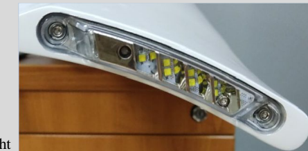
Rear Light Front Light