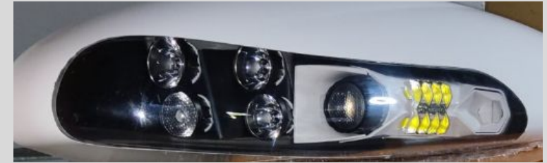
Front Light Rear Light